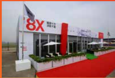
200 sqm Chalet Standard Header Graphic