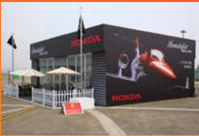
100 sqm Chalet

*Discounted pricing is available for each chalet option if application and full payment are received by January 9, 2020.