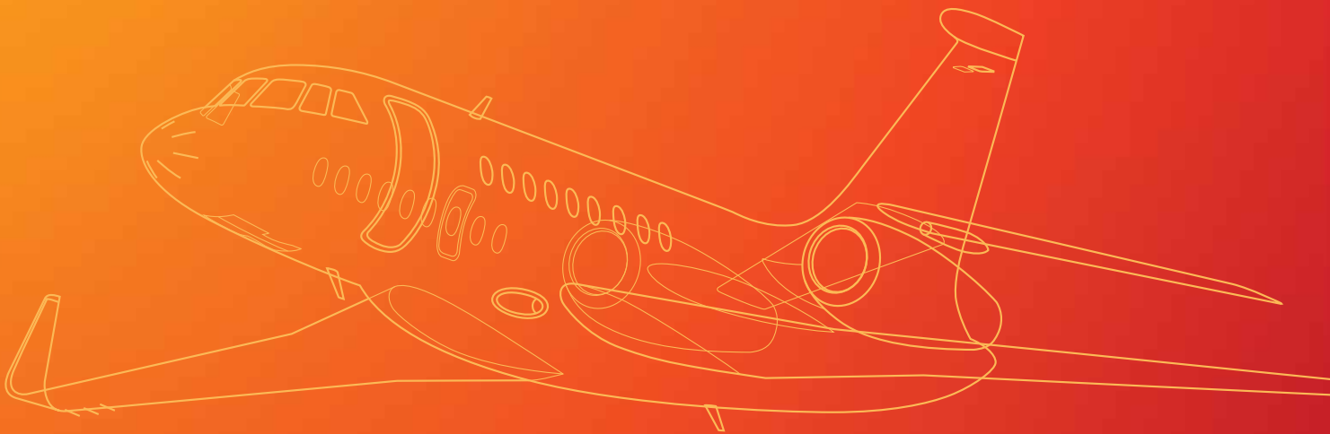
EXHIBIT AT ASIA'S MOST IMPORTANT BUSINESS AVIATION EVENT

Submit your exhibit application by the January 9, 2020 priority deadline.