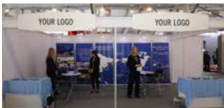
Shell-Scheme Double-Unit (Additional Fee for Wall Graphics)