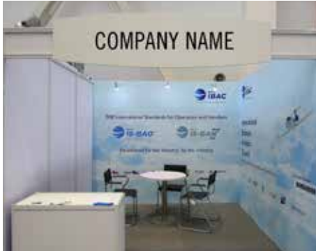
Shell-Scheme Single-Unit (Additional Fee for Wall Graphics)

ABACE management offers indoor exhibitors a special discount per 3m-by-3m indoor exhibit space reserved provided both the application and full payment are received on or before January 9, 2020. Take advantage of these discounts and make sure to book your space by the deadline to qualify for priority placement.