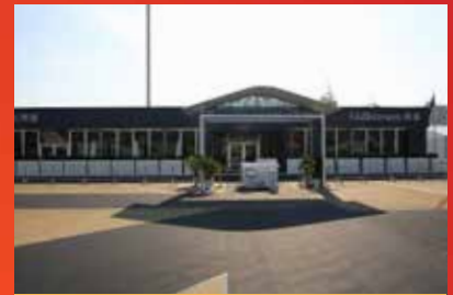
350 sqm Chalet Standard Header Graphic

Turnkey and Custom Chalets from 100 sqm to 400 sqm are available at ABACE2020.