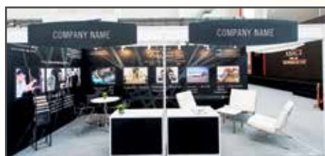
Shell-Scheme Double-Unit; Additional Fee for Wall Graphics