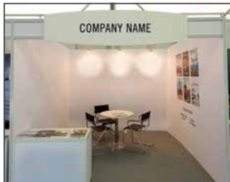
Shell-Scheme Single-Unit; Additional Fee for Wall Graphics

ABACE management offers indoor exhibitors a special discount per 3m-by-3m indoor exhibit space reserved provided both the application and full payment are received on or before January 7, 2019. Take advantage of these significant discounts and make sure to book your space by the deadline.