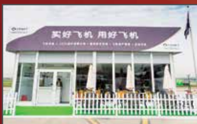
Single-Unit Chalet With Flat Roof Option

*Discounted pricing is available for each chalet option if application and full payment are received by January 7, 2019.