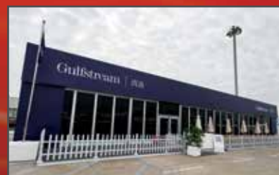
Triple-Unit Custom Chalet With Flat Roof Option; Standard Header Graphic

Turnkey and Custom Chalet Units will be available at ABACE2019.