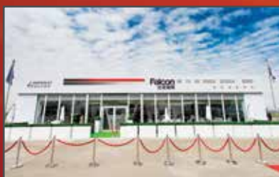
Double-Unit Custom Chalet With Flat Roof Option; Standard Header Graphic