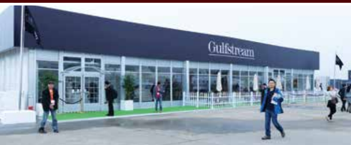
Double-Unit Custom Chalet; Standard Header Graphic

Discounted price: USD $187,000 ($7,000 savings)