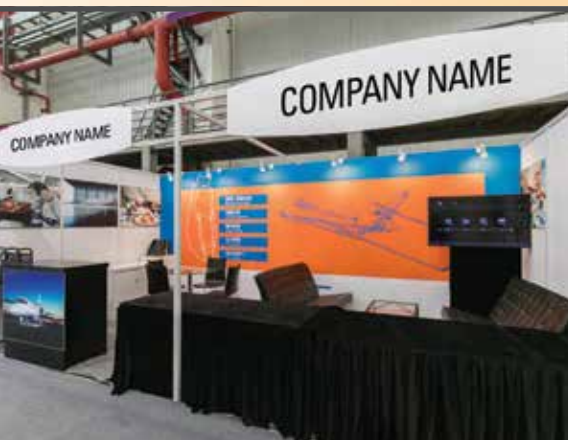
Shell-Scheme Double-Unit; Additional Fee for Wall Graphics