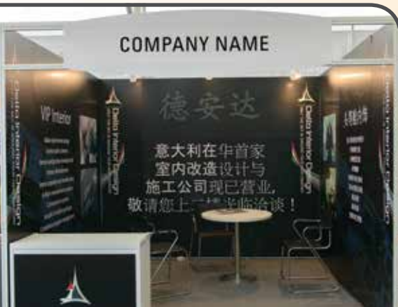
Shell-Scheme Single-Unit; Additional Fee for Wall Graphics

ABACE management offers indoor exhibitors a special $150 discount per 3m-by-3m indoor exhibit space reserved provided both the application and full payment are received on or before November 9, 2017. There are no discounts after November 9, 2017.