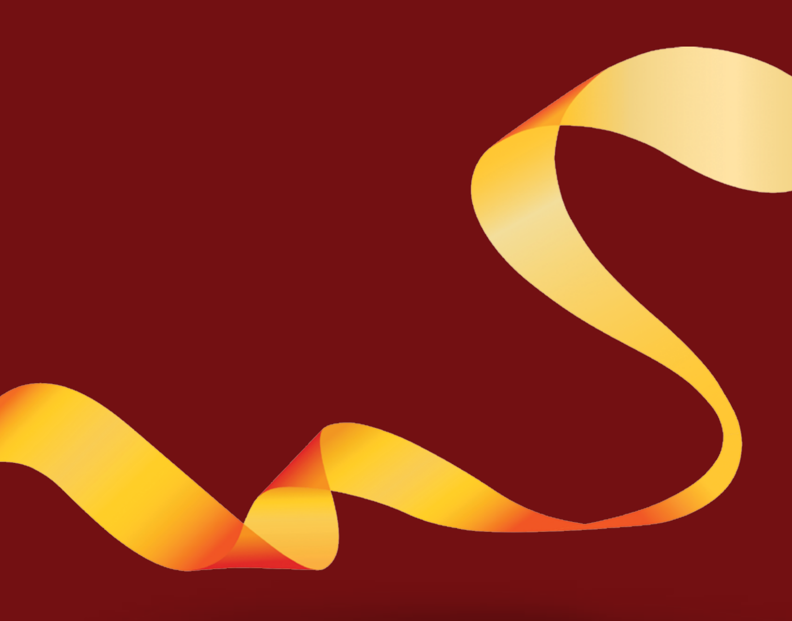
EXHIBIT AT ASIA'S PREMIER BUSINESS AVIATION EVENT

Submit your exhibit application by the November 10, 2016 priority draw deadline.