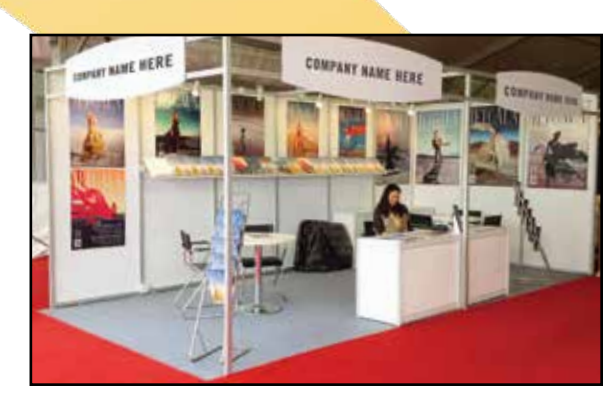
Shell-Scheme Double Unit; Additional Fee for Wall Graphics