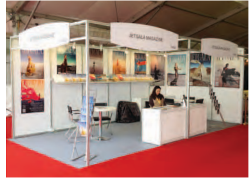
Pavilion: Shell-Scheme Double-Unit