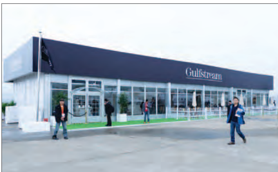
Triple-Unit Chalet, upgraded gable graphics

Discounted price: USD $334,000 ($9,000 savings)