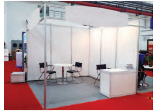
Hangar: Shell-Scheme Single-Unit

This option offers exhibitors reserving indoor hangar or exhibitor pavilion space the opportunity to move to a higher priority status. To qualify for premium placement, this option must be selected on the exhibit application and full payment – on a non-refundable basis – must be received by November 6, 2015.