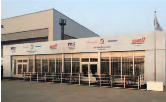
Double-Unit Chalet, upgraded graphics

Discounted price: USD $227,000 ($7,000 savings)